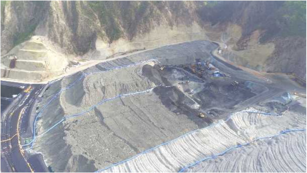
Image 2 – KK leach pads 1 to 4, with crushing and stacking units operating on leach pad 2